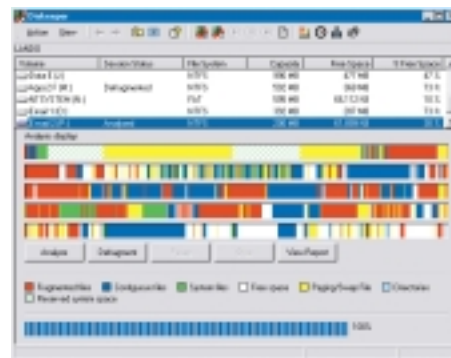
Example of a typically fragmented partition.

Disk fragmentation is inherent in the design of today’s Windows-based environments. With hundreds of files being written and deleted from disks every minute of the working day, files are divided into fragments and rapidly scattered across the hard drive into whatever space is immediately available. However, while this system simplifies writing to a disk, it results in doc-